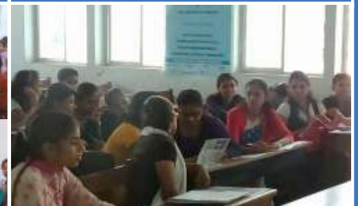
Shiksha: Teaching English and Mathematics to government school students