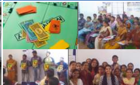
Financial Literacy Board Games