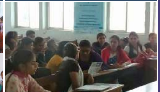
Shiksha: Teaching English and Mathematics to government school students