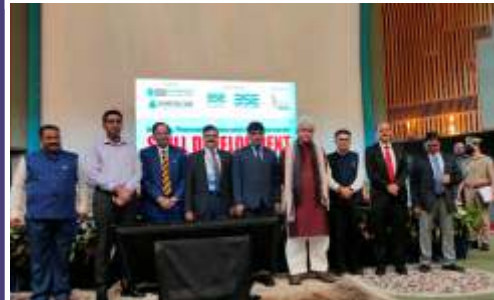
Livelihood training program in Jammu & Kashmir