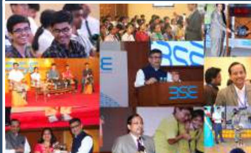
BSE International Finance Olympiad (BIFO)