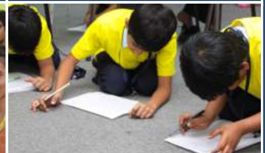
Workshops for school children on financial literacy