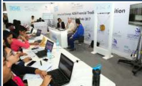
BSE Institute at World Skills Abu Dhabi, UAE 2017