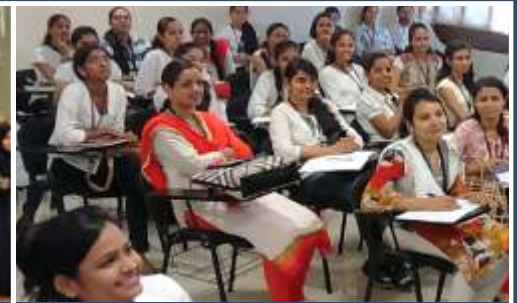
Building content to strengthen financial literacy