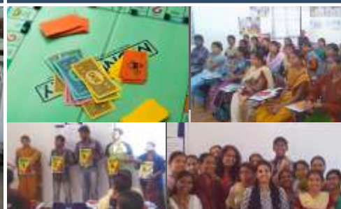
Financial Literacy Board Games