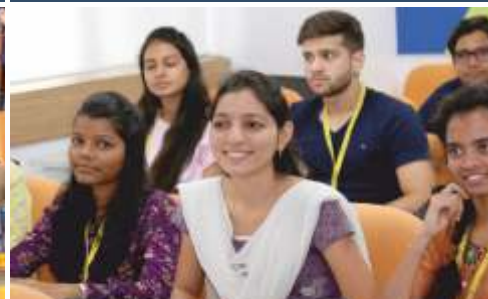
4000+ students trained for employment in BFSI sector