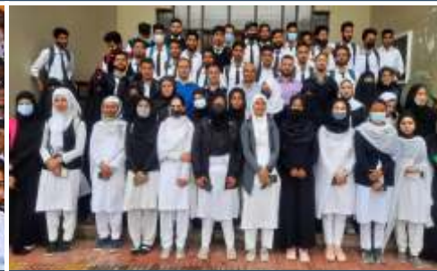
School to workplace transition with World Bank