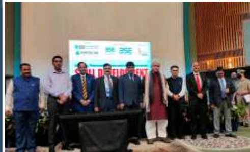
Livelihood training program in Jammu & Kashmir