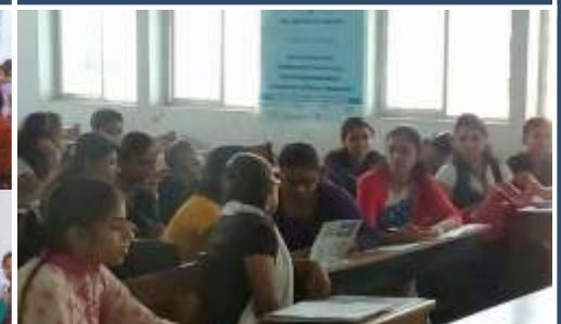
Shiksha: Teaching English and Mathematics to government school students