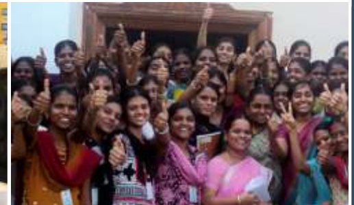
Financial literacy and life skills for rural women