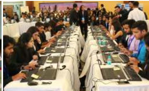
Stock Torero Event