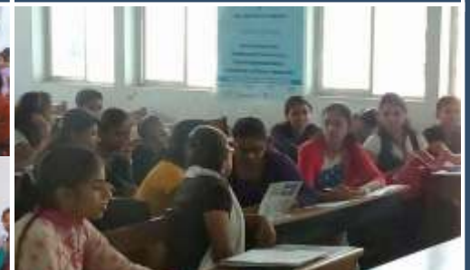
Shiksha: Teaching English and Mathematics to government school students