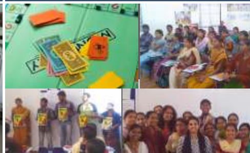
Financial Literacy Board Games